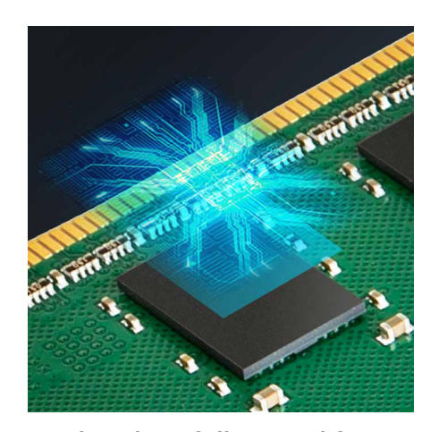
Quality chips fully tested for reliability

DDR4 delivers far less response time and application loading time than its predecessors DDR3, DDR2, and DDR. It is higher in RAM density but lower in power consumption, having brought energy requirement further down to 1.2V, making it best suited for memory-intensive applications.